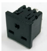
US SPEC (1)